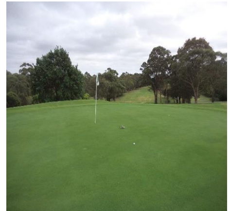
The 8th green & fairway at GGC looking a picture!

There are a few things to look out for next year. Massey Park proved popular in '23 (check the CC scores!) so we have again slotted in 2 games. We return to Springwood following this year's absence. Unfortunately, we couldn't get a suitable booking for Asquith but it has been replaced by .... a mystery venue. This will be a closely guarded secret until (very) close to the event but we can say that it is a course that suits all provided you have validity on your passports because (for some) it