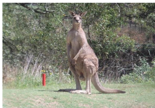
A keen observer on the par 3 11th.